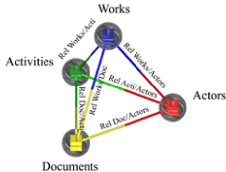
Figure 2 The relational pyramid.