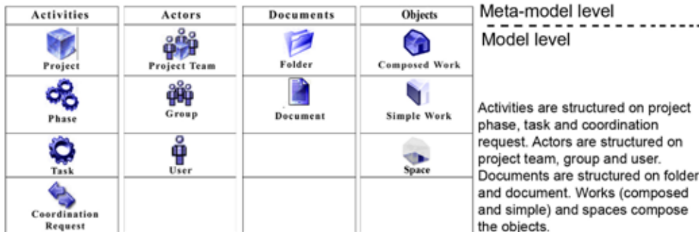
Figure 3 Icons representing concepts of cooperative activities in Bat'Map.

We conduct two experiments to test the Bat'Map capacity to assist cooperation design in a building project. The script adopted for the experiments de-