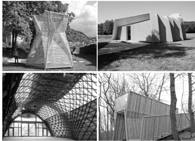
Figure 1. top-left) piling-up, BWIF Sculptures, Bergen, Norway. top-right) tessellation, Saint Loup chapel, Switzerland. Bottom-left) mesh, Weald & Dowland museum, Chichester England. Bottom-right) framework Observation platform, Trondheim, Norway.

pentagons ...) and the folding angle between them. A distinction could be made between facets and waffles.