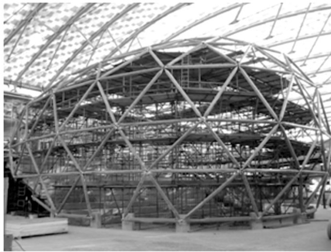
Figure 2. “Napier University”, Edimbrough, Ecosse

Parameterization of the “Napier University”, Edimbrough, Ecosse [fig. 2] shows as an example the use of parametric description.